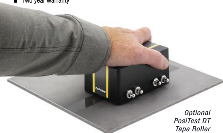
Optional PosiTest DT Tape Roller

Conforms to ISO 8502-3, AS 3894.6, US Navy PPI 63101-000